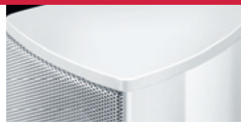
White "high gloss" lacquer White metal lattice