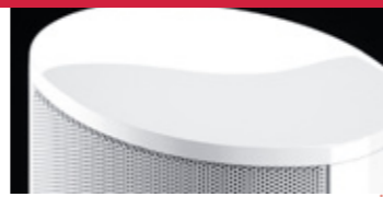
White "high gloss" lacquer White metal lattice

Its sound performance is as mature and powerful as its appearance is slender and elegant. The modified cabinet geometry, new surface finishes and the revised structure of the front covers are the technical secret behind the new speakers of the CD series and the reason for the tonal finesse. You will be persuaded by the more finely tuned speaker technology underneath, based on aluminum membranes.