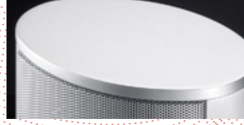
Silver anodized aluminum Silver metal lattice