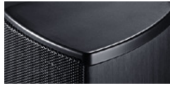
Black anodized aluminum Black metal lattice