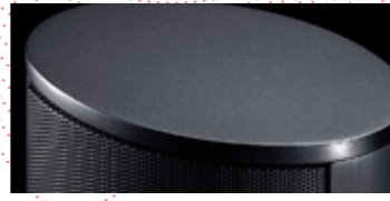
Black anodized aluminum Black metal lattice