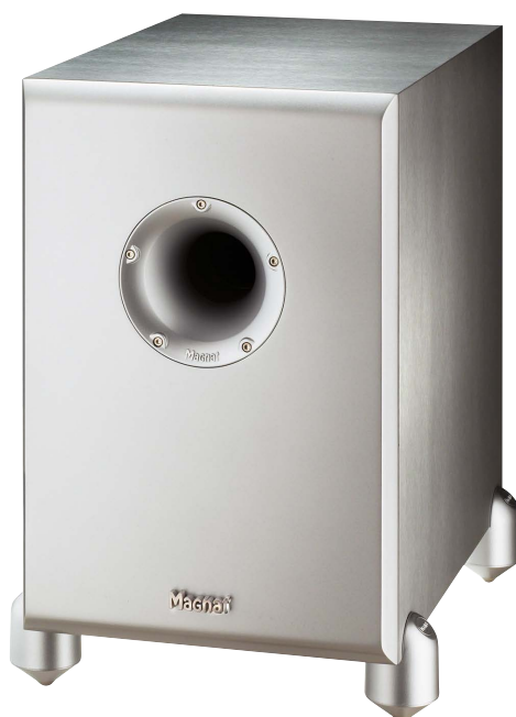
Silver (only 20A)