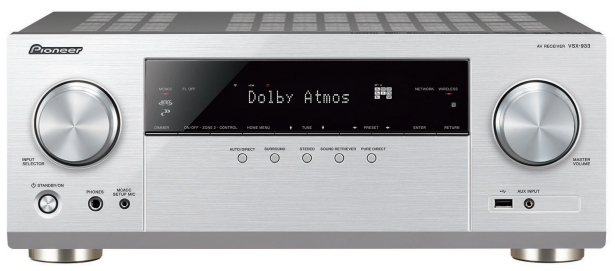
Silver model also available in Europe

Immerse yourself in the 5.2.2ch surround sound created by Dolby Atmos® or DTS:X® and optimally adjusted by MCACC, while the spectacle of Ultra HD video, HDR10, HLG, and Dolby Vision™ unfolds before your eyes. FlareConnect™ lets you enjoy wireless multi-room audio with smooth control on the Pioneer Remote App, from various sources including vinyl records. With Chromecast built-in and DTS Play-Fi®, you can play music from internet radio and network streaming services on the VSX-933 using your smartphone.