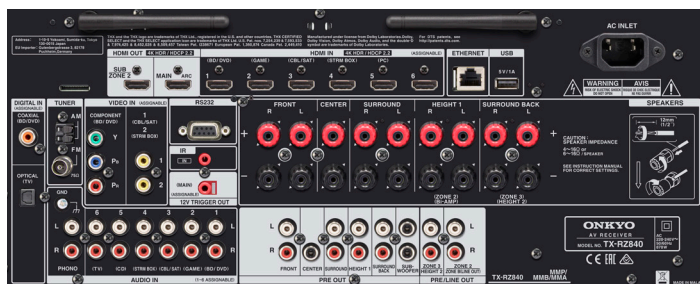
Text on receiver may vary with region.